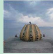
Yayoi Kusama "Pumpkin"

There are many outdoor artworks around Benesse House, set against the beautiful scenery for the Seto Inland Sea.