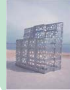
Shinro Ohtake "Shipyard Works 'Stern with Hole'"